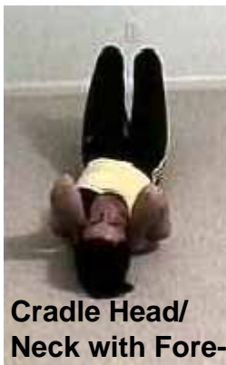
Cradle Head/ Neck with Fore- arms