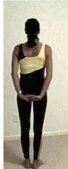
From the back

Clasp your hands behind your back. Take a deep breath and raise your arms as high as possible behind you, as you try to squeeze your elbows together. Push your chest up and out toward the ceiling.